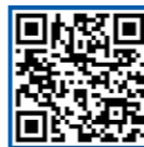
PNU Summer School